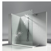
NATURAL DECORS P19 BLOW