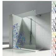
NATURAL DECORS P16 AZULEJOS