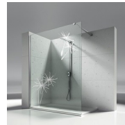
NATURAL DECORS P19 BLOW