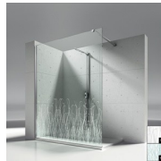
NATURAL DECORS P15 ORGANIC