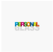
ACCESSORIES PERSONAL GLASS