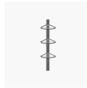
EQUIPPED COLUMN AMICO