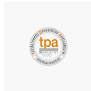
TREATMENT LIME SCALE TREATMENT PREVENTING LIMESCALE (TPA)