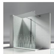
NATURAL DECORS P15 ORGANIC