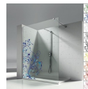
NATURAL DECORS P16 AZULEJOS