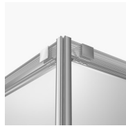
ACCESSORIES SCREEN PRINTED STRIPE