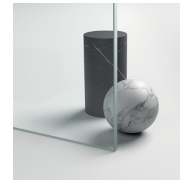
GLASS PANE 12 - EXTRA-LIGHT GLASS