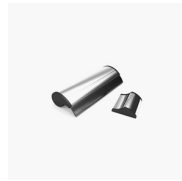
ACCESSORY FOR GLASS CLEANING VIRGOLA