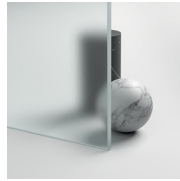
SPECIAL TEMPERED SAFETY GLASSES 14 - CRYSTAL EXTRA-LIGHT SATIN