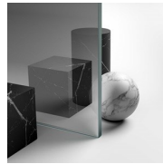
GLASS PANE 06 - REFLECTING GLASS