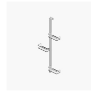
EQUIPPED COLUMN BASKET