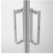
KNOB AND HANDLES M10G STANDARD