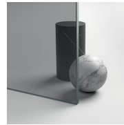
GLASS PANE 07 - CLEAR GREY