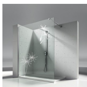
NATURAL DECORS P19 BLOW