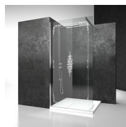
GRAPHIC DECORS P56