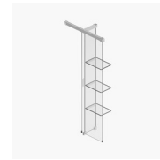
PARTITION PANEL SCREEN BASKET