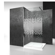
GRAPHIC DECORS D54